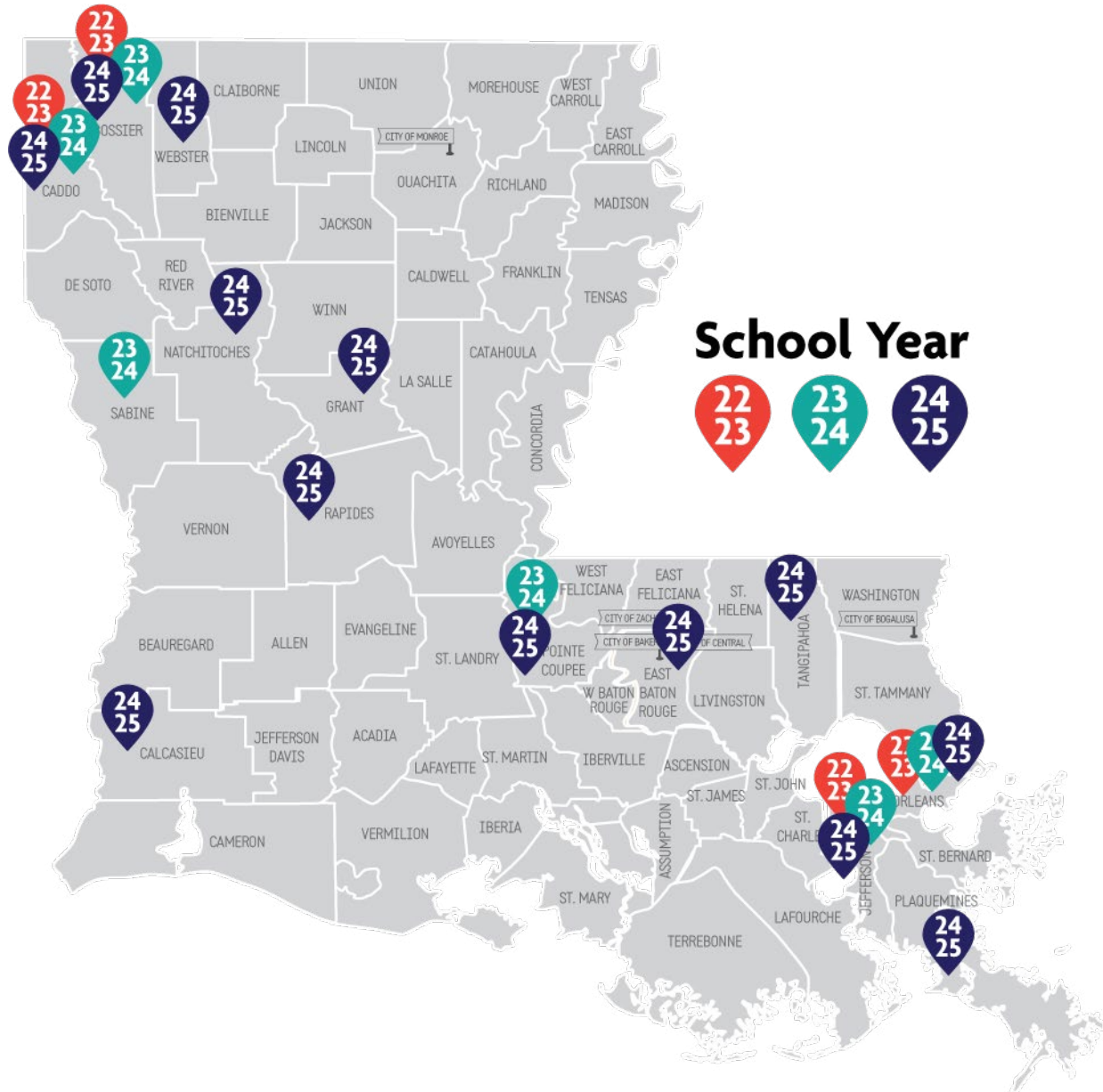
ECE FUND-ELIGIBLE PARISHES OVER TIME

The Louisiana ECE Fund offers a dollar-for-dollar state match for non-federal and non-state funds secured by local entities. During 2024-25, projections estimate that local funding will generate the need to match more than $31 million from 14 parishes. Although as of early January 2024 there is a balance of $32.8 million, the ECE Fund is projected to be nearly depleted by the end of academic year 2024-25 and be unable to match funds raised in local communities in 2025-26. Louisiana should continue to capitalize on the tremendous momentum to support early childhood care and education that is building in local communities across the state. By passing a new law that codifies the State’s commitment to provide matching dollars for local funds raised for early childhood education, the Louisiana State Legislature can hold true to the State’s good faith promise to communities, families, and children.