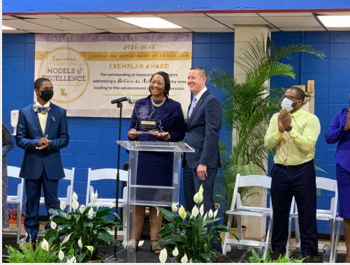
East Feliciana Public Schools