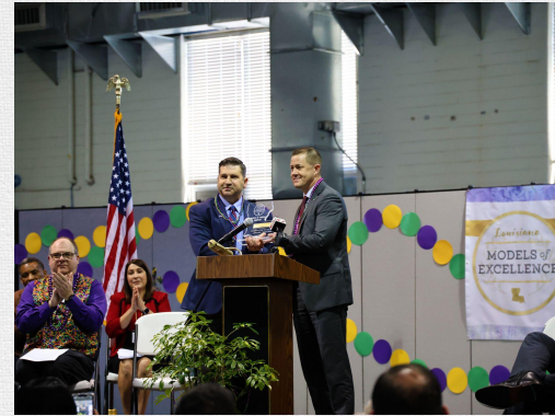
Calcasieu Parish School Board