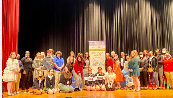
Rapides Parish Schools