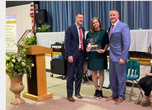
Mansfield Elementary School DeSoto Parish Schools