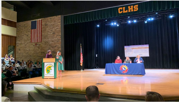
Lafourche Parish School District