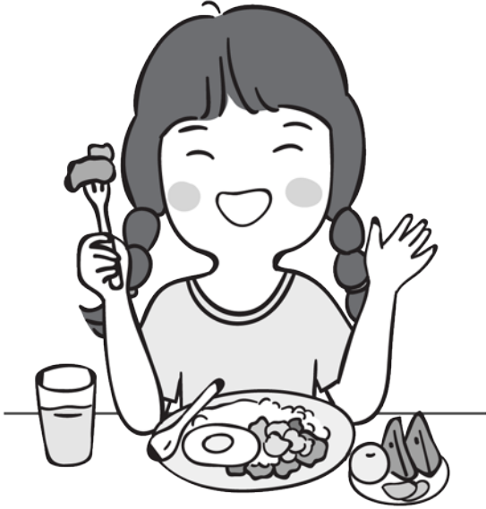
Card 6a Eat lunch (Practice)