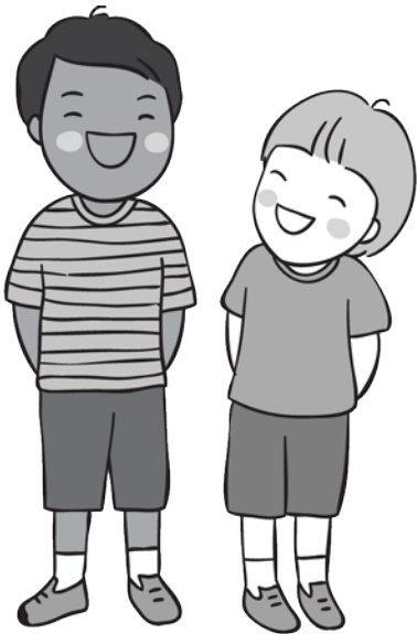
Card 7a Talk to friends (Practice)