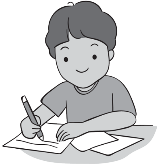
Card 2a Take a test (Practice)