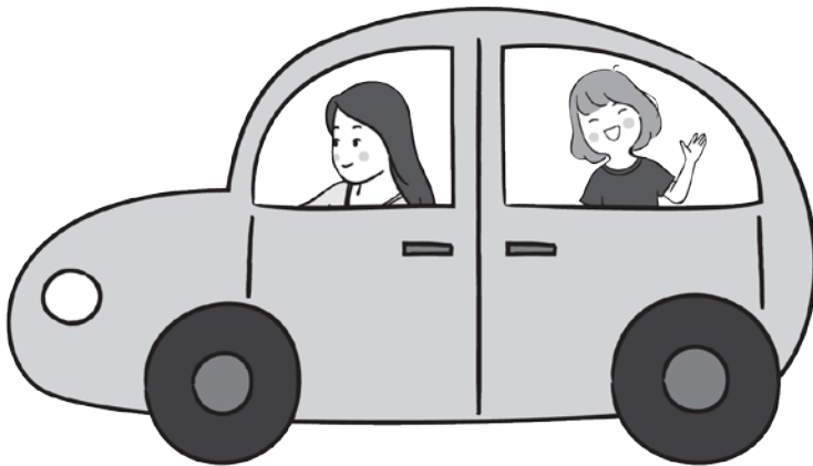
Card 5a Ride in a car (Practice)