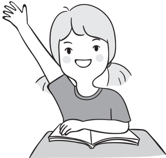
Card 3a Raise your hand (Practice)