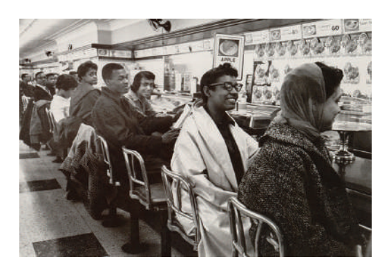
Sit-ins were peaceful protests against segregated places such as lunch counters.

People rode buses from state to state to protest in towns and cities that allowed segregation. They marched in the streets. Many people were arrested for taking part in these peaceful protests. King was arrested many times.