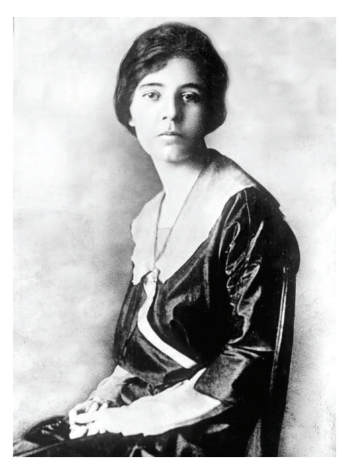
Alice Paul led thousands of people in a march for women's suffrage.

Then, in 1917, Alice Paul organized groups of women to picket at the White House. They