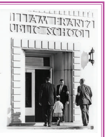
Ruby Bridges being escorted into school

On May 17, 1954, the Supreme Court, in the case of Brown v. Board of Education , ruled that segregation in public schools was against the Constitution. This meant that it was illegal for schools to separate students by race. However, across the South, many white people resisted this ruling. In 1960, in Louisiana, a federal court ordered that all of its schools must be desegregated. And on November 14, 1960, six-year-old Ruby Bridges walked into the history books as the first Black child to attend an all-white elementary school in New Orleans.