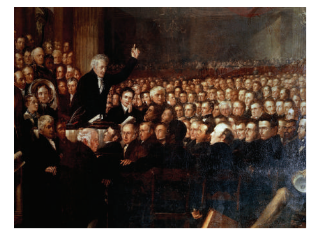
At the World Anti-Slavery Convention, women were not allowed in the main audience.

Elizabeth Cady Stanton hated slavery. She attended the World Anti-Slavery Convention in London in 1840. Women at the convention could only sit in the balcony—they could not participate.