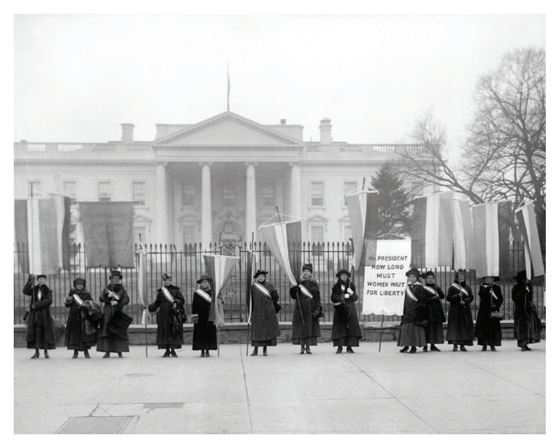
The women who picketed the White House were called the Silent Sentinels.

Despite the new law, many women of color were still discouraged or even prevented from voting. Both Alice Paul and Mabel Ping-Hua Lee continued to fight for women's rights. It took decades after the Nineteenth Amendment was passed for the voting rights of women of color to be protected throughout the United States.