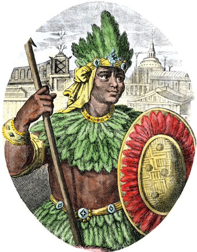
Moctezuma II ruled the Aztec Empire at the height of its great power.

The Aztec believed the world might end at any moment. Moctezuma and his priests worried that the strange events might be a warning from the gods. They feared that the end of the world might be near. As it turned out, a form of doomsday was coming, but it was not coming from the gods. It was coming from Europe.