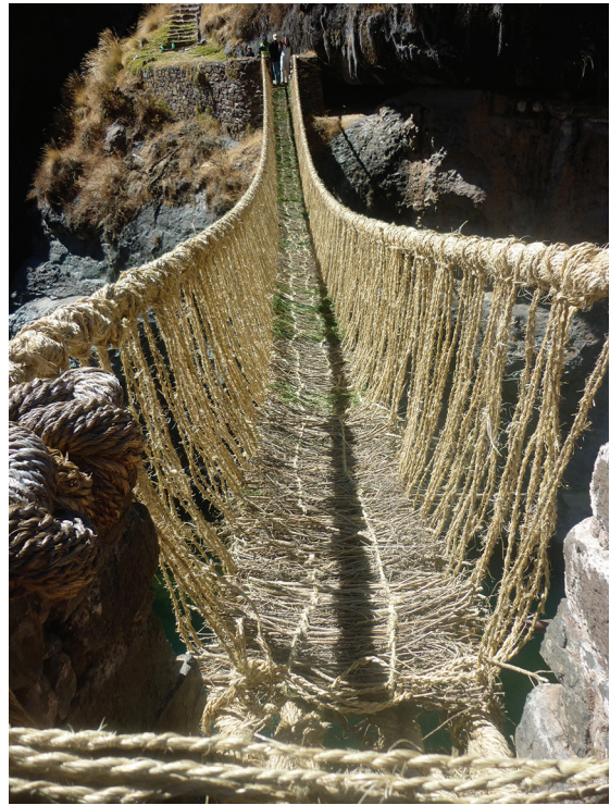
The Q'eswachaka bridge hangs over the Apurímac River in Peru.

(/ahp*uh*ree*mahk/) River in Peru is a fine example. It was built over a steep river gorge around 1350 CE. It was a suspension bridge, held together by heavy strands of rope. The ropes were replaced every two years. This amazing bridge was in service from 1350 CE until 1890 and still exists today! It is one of the greatest achievements of the Inca engineers.