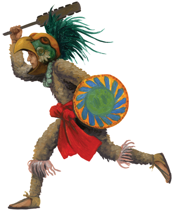
This is an Eagle warrior dressed for battle.

the same village were usually kept together. These groups formed the building blocks of larger armies. Soldiers were well equipped with shields, bows, clubs, spears, and a deadly device called an atlatl . This weapon could throw darts at high speeds. Some elite warriors who had been involved in several conflicts were identified as Eagle warriors and given special equipment.