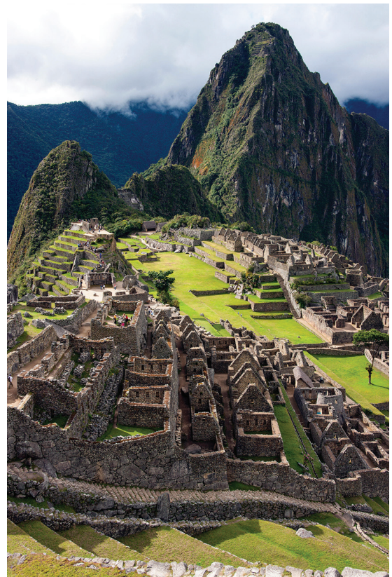
Machu Picchu is in modern-day Peru.