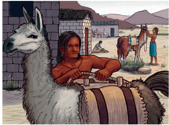
The llama is a useful animal that served the Inca people mainly as a pack animal.

The Inca used llamas to transport goods. They also used the llama's wool for cloth, its hide for rugs and coats, its waste for fuel and fertilizer, and its meat for food. When a llama died, the Inca cut the meat into strips and dried it in the sun. They called these strips charqui (/chahr*kee/). This is the source of the English word for dried meat, jerky .