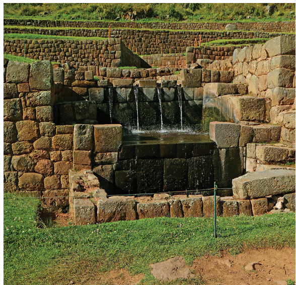
This fountain built by the Inca in Cuzco, Peru, shows the precision and skill involved in their engineering projects.

Parts of the Royal Road were made of packed dirt.