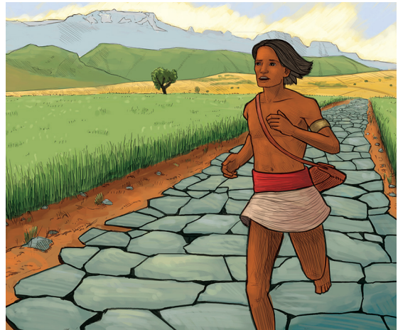
Inca runners were able to move messages quickly over the full length of the empire.

Another marvel of Inca engineering is the famous city of Machu Picchu (/mah*choo/pee*choo/). Machu Picchu is a mountain fortress seven thousand feet (2,133 meters) above sea level, located about fifty miles (eighty kilometers) northwest of Cuzco. It sits in a high valley between two peaks of