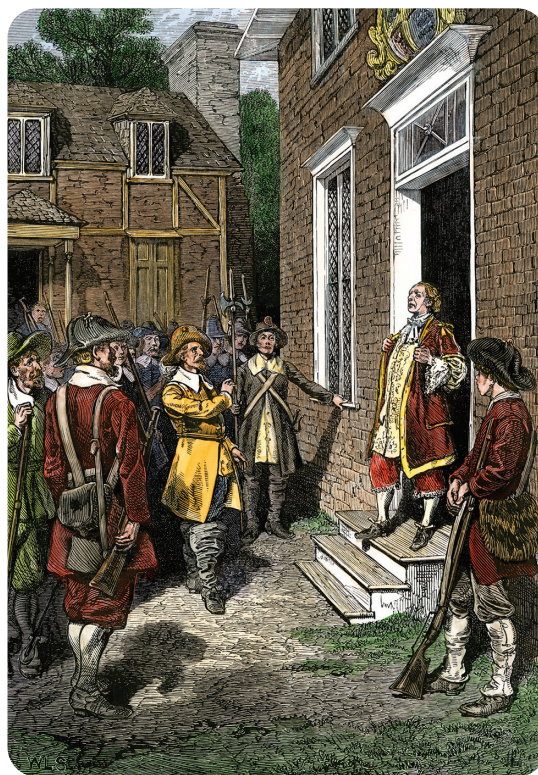
Bacon's Rebellion resulted in several confrontations between Nathaniel Bacon's followers and Virginia Governor Sir William Berkeley.