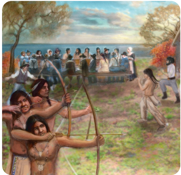
The celebration of thanksgiving between the Wampanoag and the Pilgrims lasted three days.

Bradford was careful to maintain friendly relations with the local Indigenous people. In 1621, he sent men to hunt turkey and organize a community feast of thanksgiving. Many Wampanoag also attended. This Thanksgiving feast has become part of American tradition, commemorating a time when the Pilgrims shared a meal with the Wampanoag and gave thanks to God for their survival.