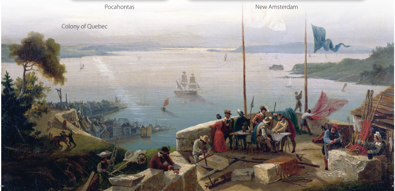
Colony of Quebec