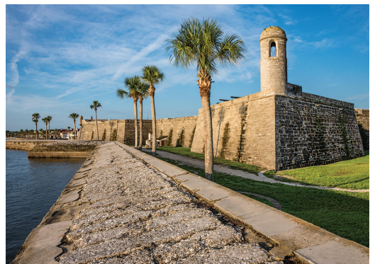
Castillo de San Marcos, a fort built by the Spanish to defend their recently claimed territory, still stands in St. Augustine, Florida, today. Spanish masons and an enslaved Indigenous workforce built it with blocks of limestone.