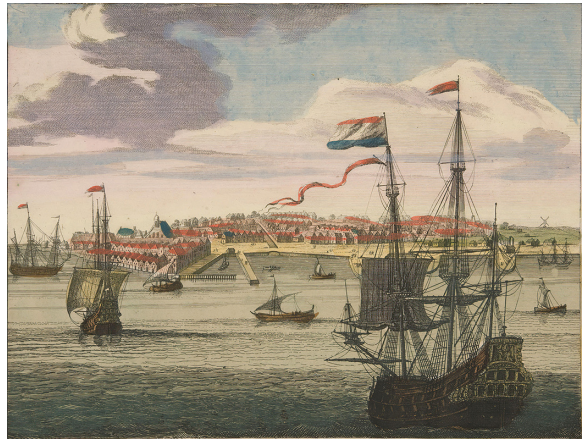
Located in present-day New York City, the town of New Amsterdam was renamed New York when the English took control of it in 1664.

exploited the region's natural resources and constructed trading posts for these resources and other goods. This process contributed to the European domination and colonization of large parts of North America—and it had an enormous negative impact on Indigenous peoples already living on the continent.