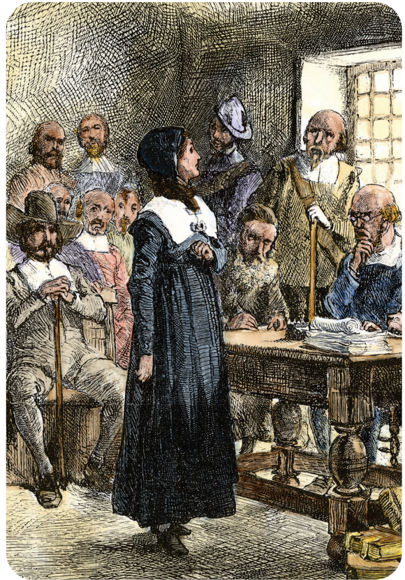
Anne Hutchinson was banished from Massachusetts because she was regarded as a threat to the colony's leaders.

Not everyone who lived in the Massachusetts Bay Colony agreed with all of the colony's laws. This included Anne Hutchinson, who spoke out against some of the Puritans' religious beliefs. She was the wife of a successful merchant and hosted Bible studies in her home. Hutchinson discussed sermons with both men and women. This was shocking to the Puritan leaders since they did not allow women to be leaders. Hutchinson gained a large following and was known for her expertise on religious topics, which threatened the authority of Puritan leaders. As a result, these officials banished her from the Massachusetts Bay Colony in 1638.