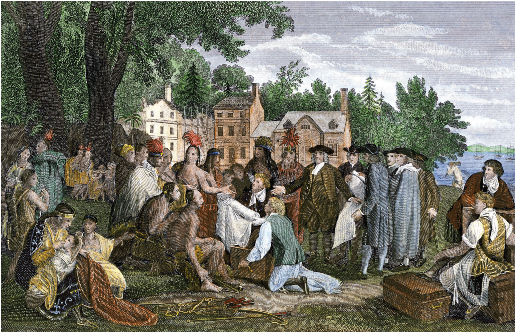
This painting shows William Penn signing a treaty with Indigenous peoples in the Pennsylvania colony.

other religious groups could live together in harmony. Originally, he named the colony Sylvania. However, King Charles renamed the colony Pennsylvania in honor of Penn's father. This name means "Penn's Woods." Penn wrote booklets to advertise his colony that highlighted the beauty of the land and promised religious freedom for all who made their home there.