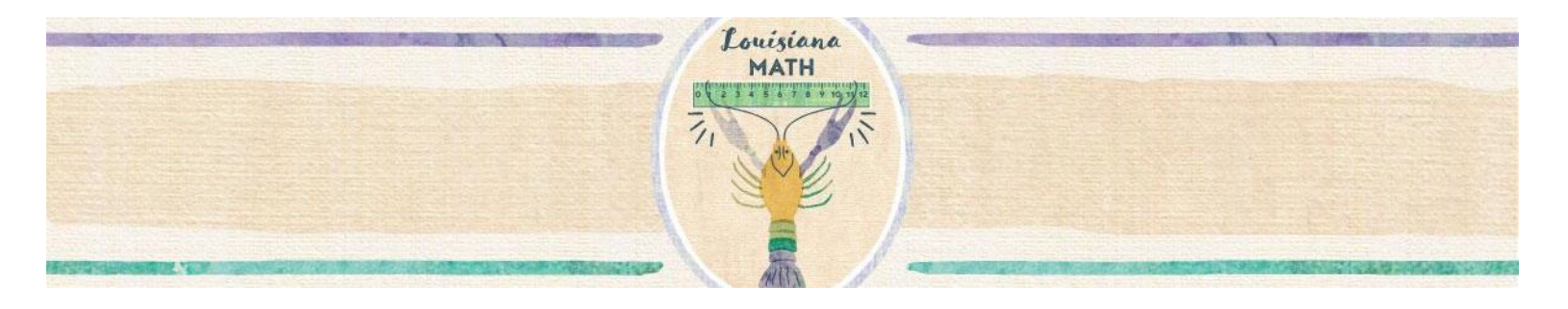
FLAME Grade 1 Unit 3 Teacher Tracking Tool for Individual Students